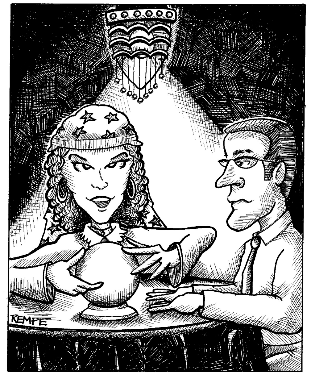
Hmmm...very interesting. This is telling me that your sales success is up to you, not what some crystal ball says.

There's another more direct explanation for a prospect's "money's no problem" answer. It's "no problem" because the prospect has already made up his mind that you're not getting any of it.